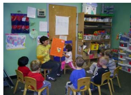
Photo: Pre-K Rainbow Room, Growing Oaks, Fall 2008

Each center also has specific needs—check the bulletin boards and monthly newsletters!